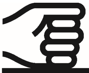
To Help (1)

Join in with our Sign of the Week. Make and share your own video using the hashtag #WeTalkMakaton.