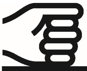
To Help (1)

Join in with our Sign of the Week. Make and share your own video using the hashtag #WeTalkMakaton.